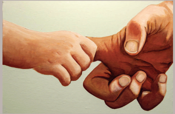
Friends For Life