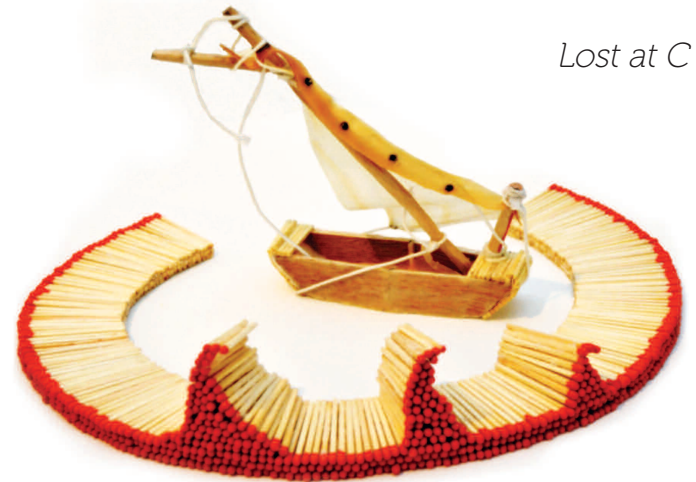
Lost at C